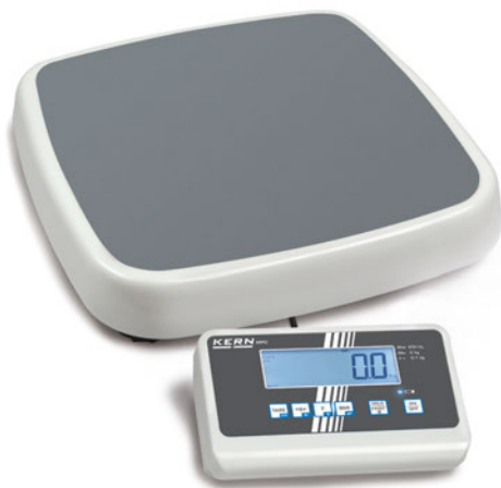
KERN MPC 250K100M