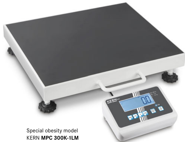
Special obesity model KERN MPC 300K-1LM